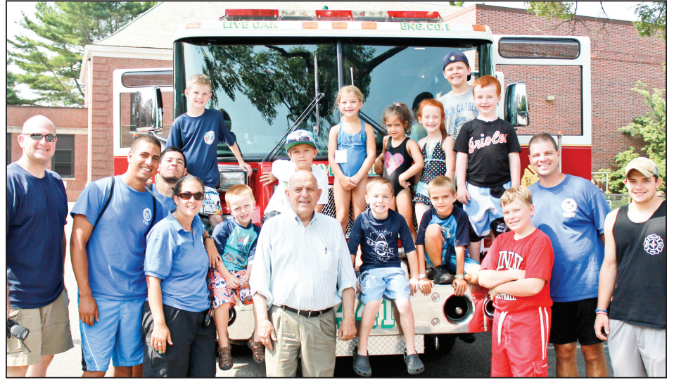
The 60th Summer Playground Program was a success with a host of activities for all to enjoy.

DETAILED INFORMATION FOR ALL ACTIVITIES CAN BE FOUND AT THE RECREATION CENTER OFFICE, ON THE RECREATION CENTER'S NEW WEBSITE AT WWW.RVCREC.WEBLY.COM , OR BY CALLING THE RECREATION CENTER AT 678-9238.