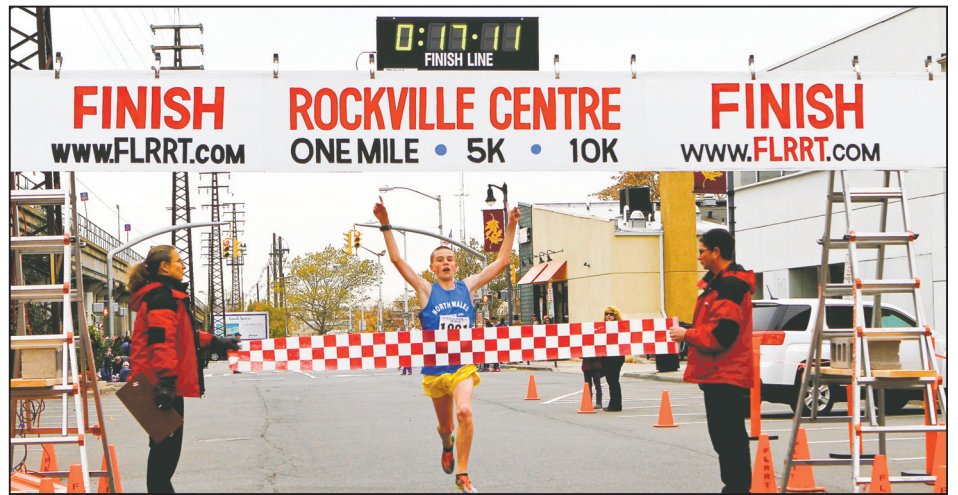
The Family Fun Run precedes the 10K and 5K races on Saturday, November 8th. Sign up at the Rec.