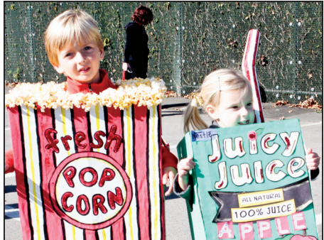
Enjoy the costumes at the annual Ragamuffin Parade and Party on Sunday, October 26th.

The weight room at the Rec is available to adults seven days a week for $30 a month for residents and $35 a month for non-residents. The room features a treadmill, recumbent bike, rowing machine, Stairmaster and Arc Trainer, as well as free weights, Cybex machines and a bench cage.